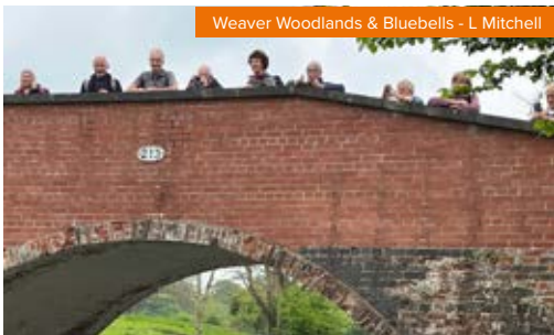
Weaver Woodlands & Bluebells - L Mitchell