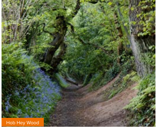
Hob Hey Wood