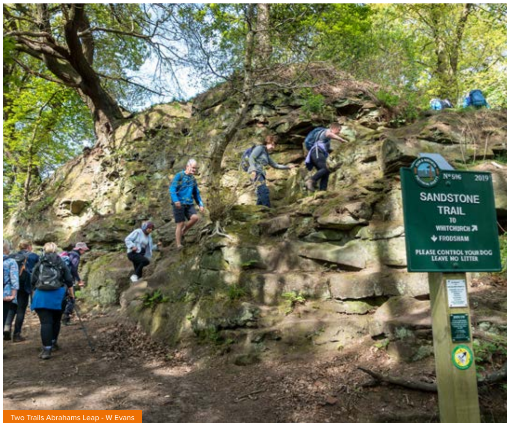
Two Trails Abrahams Leap - W Evans