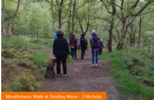
Mindfulness Walk at Snidley Moor